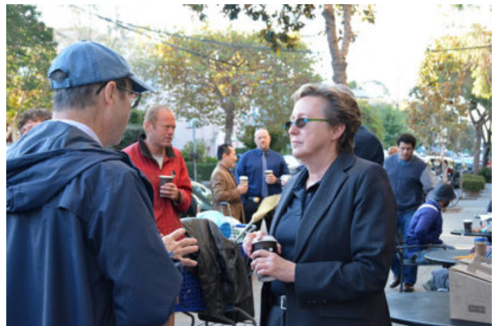
Chief joins in National Coffee with a Cop Day