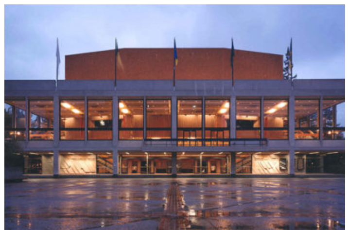
Ben Shapiro visit update: Safe navigation around campus...