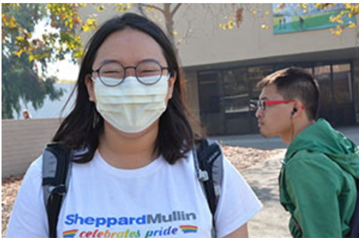
Campus offers advice on air quality and health