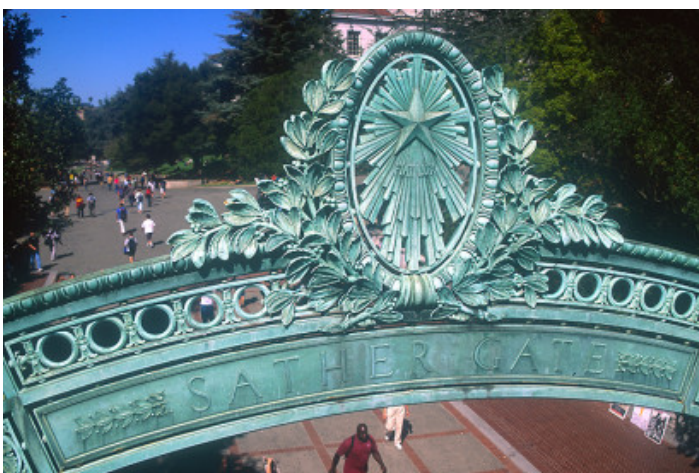
Campus community update on Sept. 24-27 events cancellation