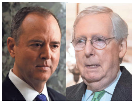
ADAM SCHIFF ; MITCH MCCONNELL

Vice President Mike Pence also traveled to Michigan, firing up the crowd before Trump took the stage. He told the crowd Pelosi would get her say tonight, but "the Republican Senate is going to have their say in January."