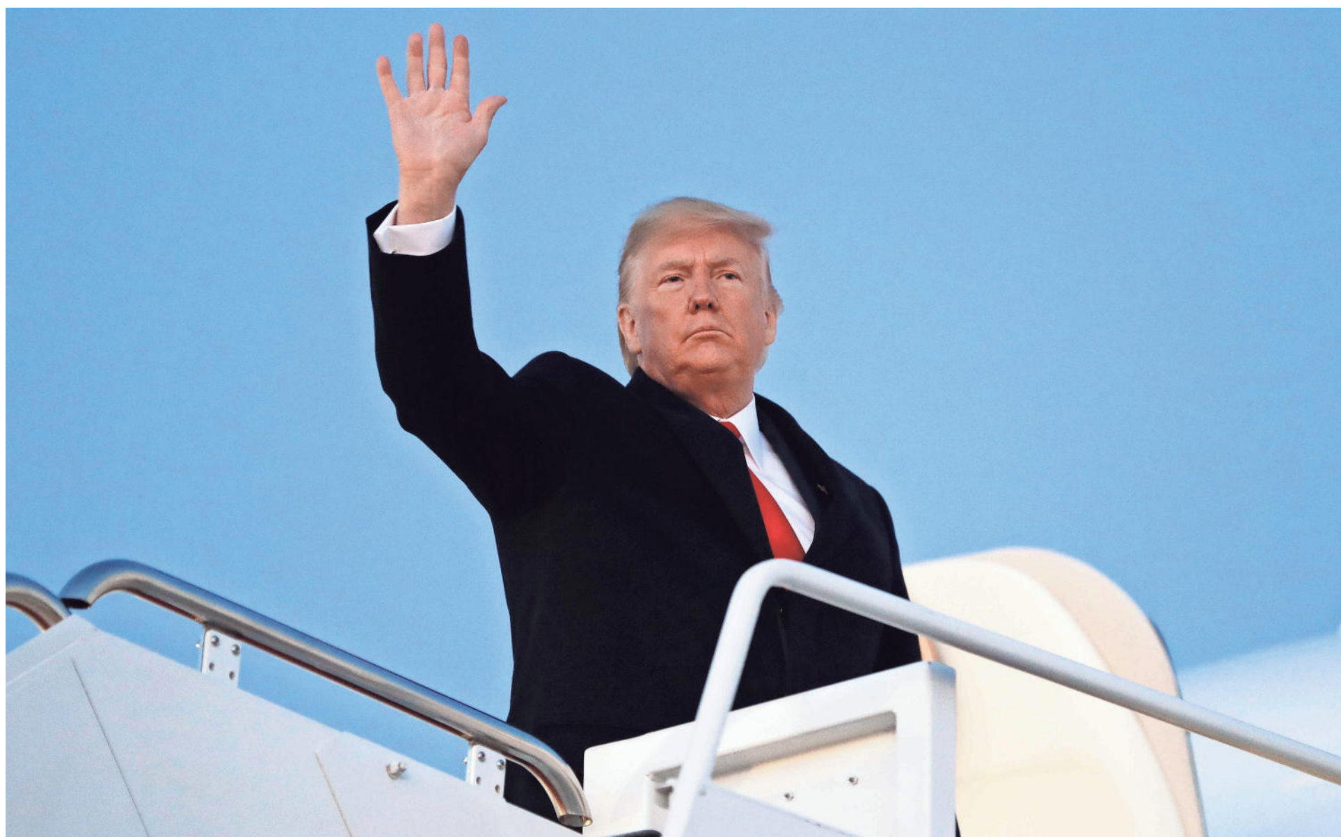
President Donald Trump boards Air Force One for a rally in Battle Creek, Mich., on Wednesday ahead of the House impeachment vote.

The People: U.S. divided; profoundly split on country's future