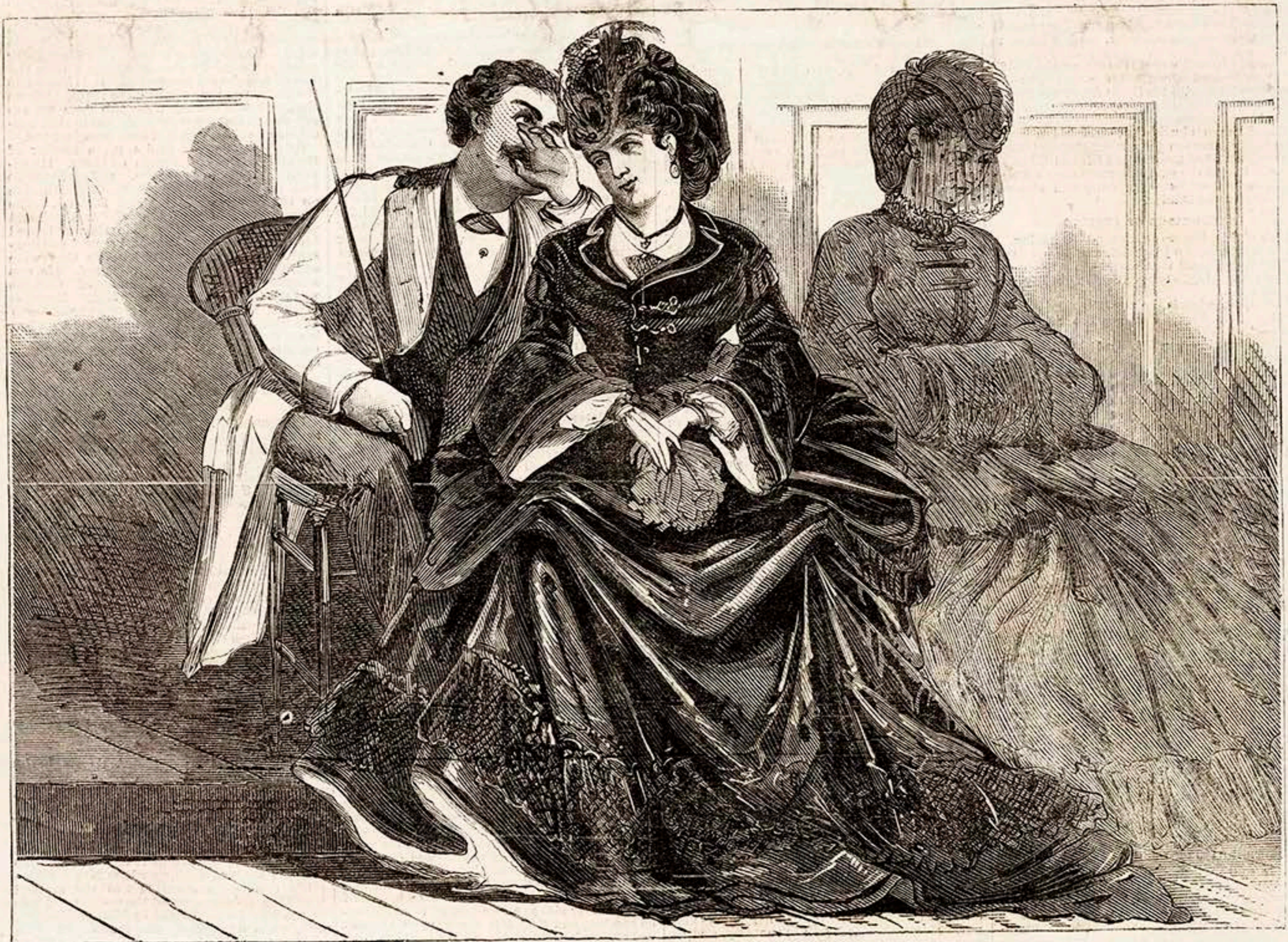
Scene at the Closing Hour of the Fisk-Mansfield Trial in the Yorkville Police Court on the Day of the Assassination.