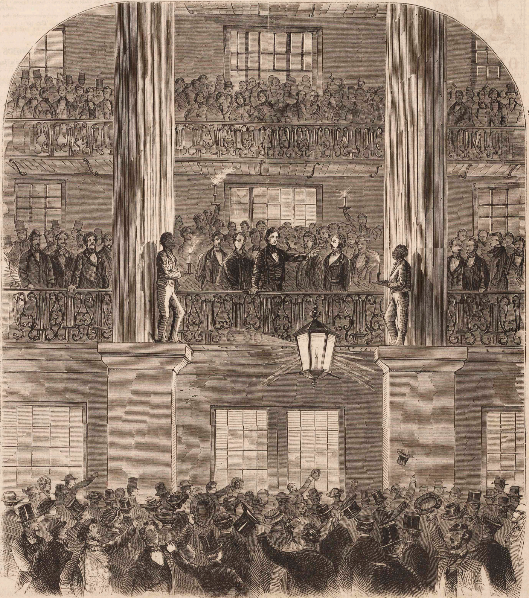
THE HON. JEFFERSON DAVIS, PRESIDENT-ELECT OF THE NEW SOUTHERN CONFEDERACY, ADDRESSING THE CITIZENS OF MONTGOMERY, ALA., FROM THE BALCONY OF THE EXCHANGE HOTEL, ON THE NIGHT OF FEBRUARY 16TH, 1861, AND PREVIOUS TO HIS INAUGURATION.—FROM A SKETCH BY OUR SPECIAL ARTIST.—SEE PAGE 258.