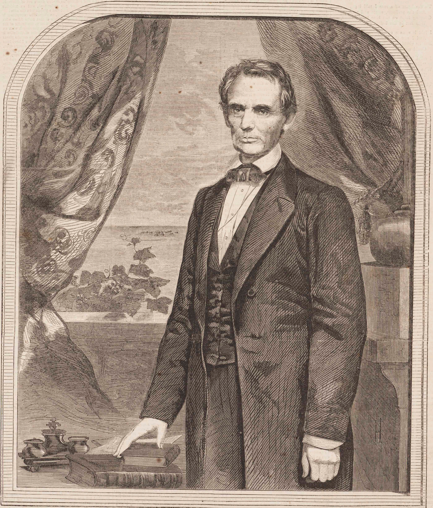
HON. ABRAHAM LINCOLN, BORN IN KENTUCKY, FEBRUARY 12, 1809.

Entered according to Act of Congress, in the Year 1860, by Harper & Brothers, in the Clerk's Office of the District Court for the Southern District of New York.